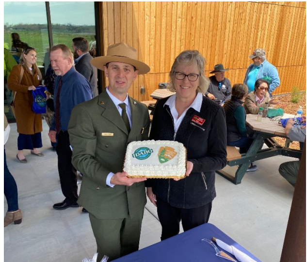
Thousand Springs Dedication