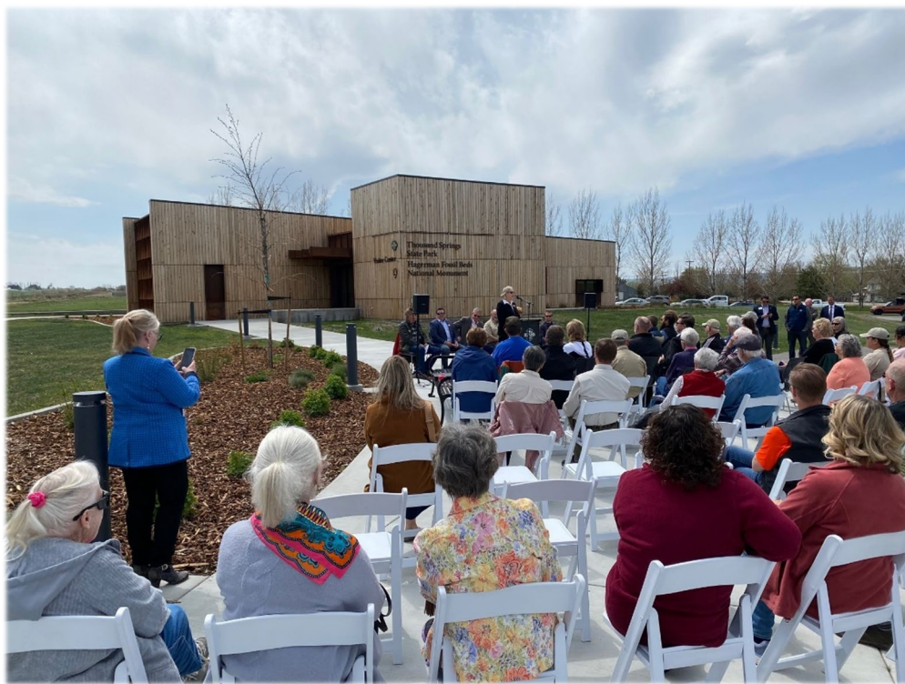
Thousand Springs Dedication