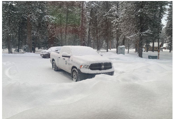
Ponderosa Snowstorm April 14, 2022

We were also able to meet with some representatives from United Payette to discuss the endowment lands and the park. It was amazing how much it snowed the one night we were staying in the Ponderosa cabins!