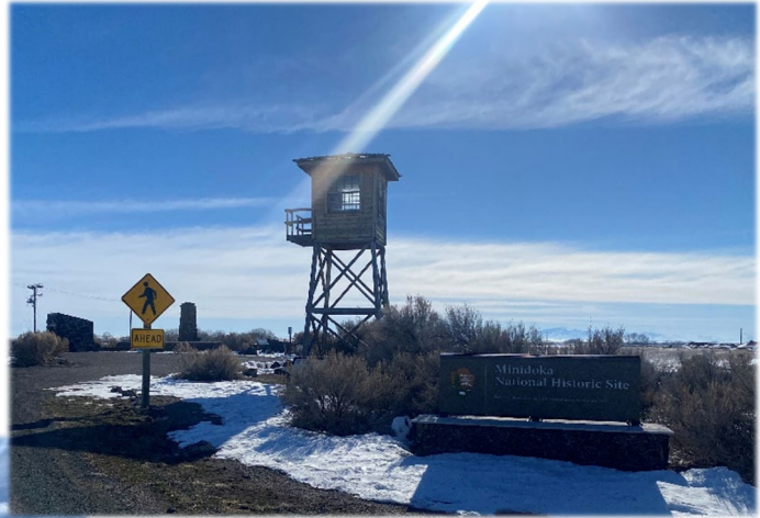
Minidoka National Monument