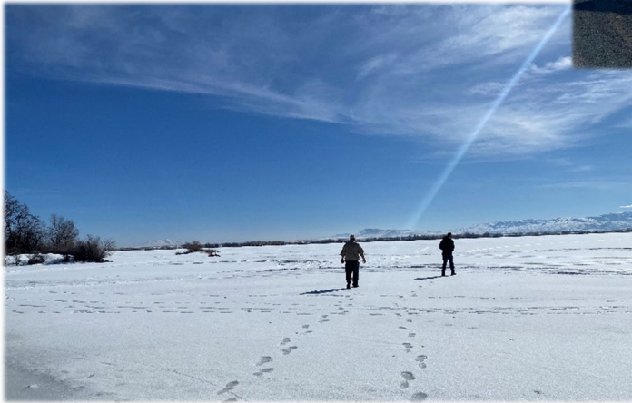
Lake Walcott frozen over