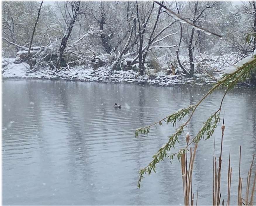
Mallard in the Snow at Headquarters May 9, 2022