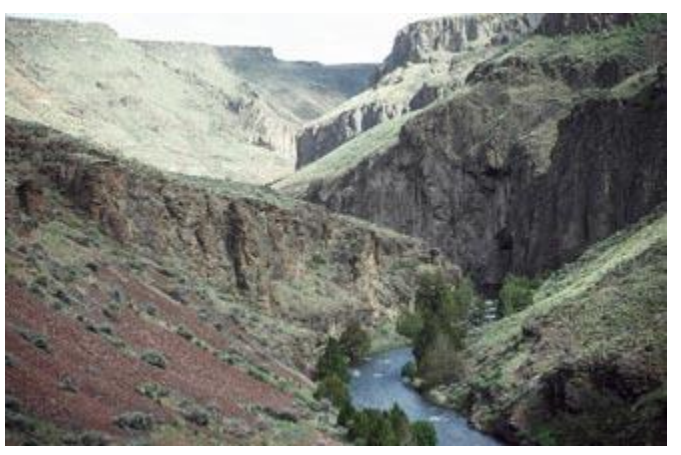
Jarbidge Canyon in southern Idaho

Here on the Idaho Department of Parks and Recreation web site, we provide information about the history of the trail's inspiration and designation, how to prepare for a trip on the