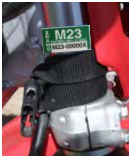
Motorbike - Riders right fork.