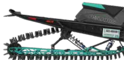
Snowmobile - The validation sticker shall be located on the snowmobile and shall be completely visible and shall be maintained in legible condition whenever the snowmobile is in operation.