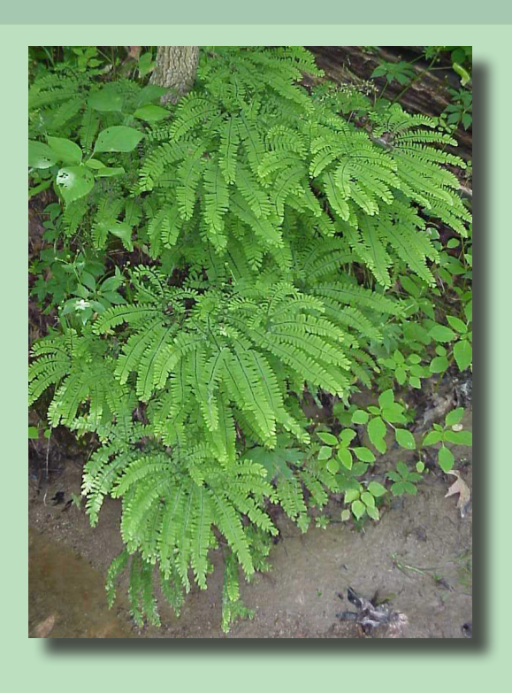
Idaho Department of Parks and Recreation parksandrecreation.idaho.gov