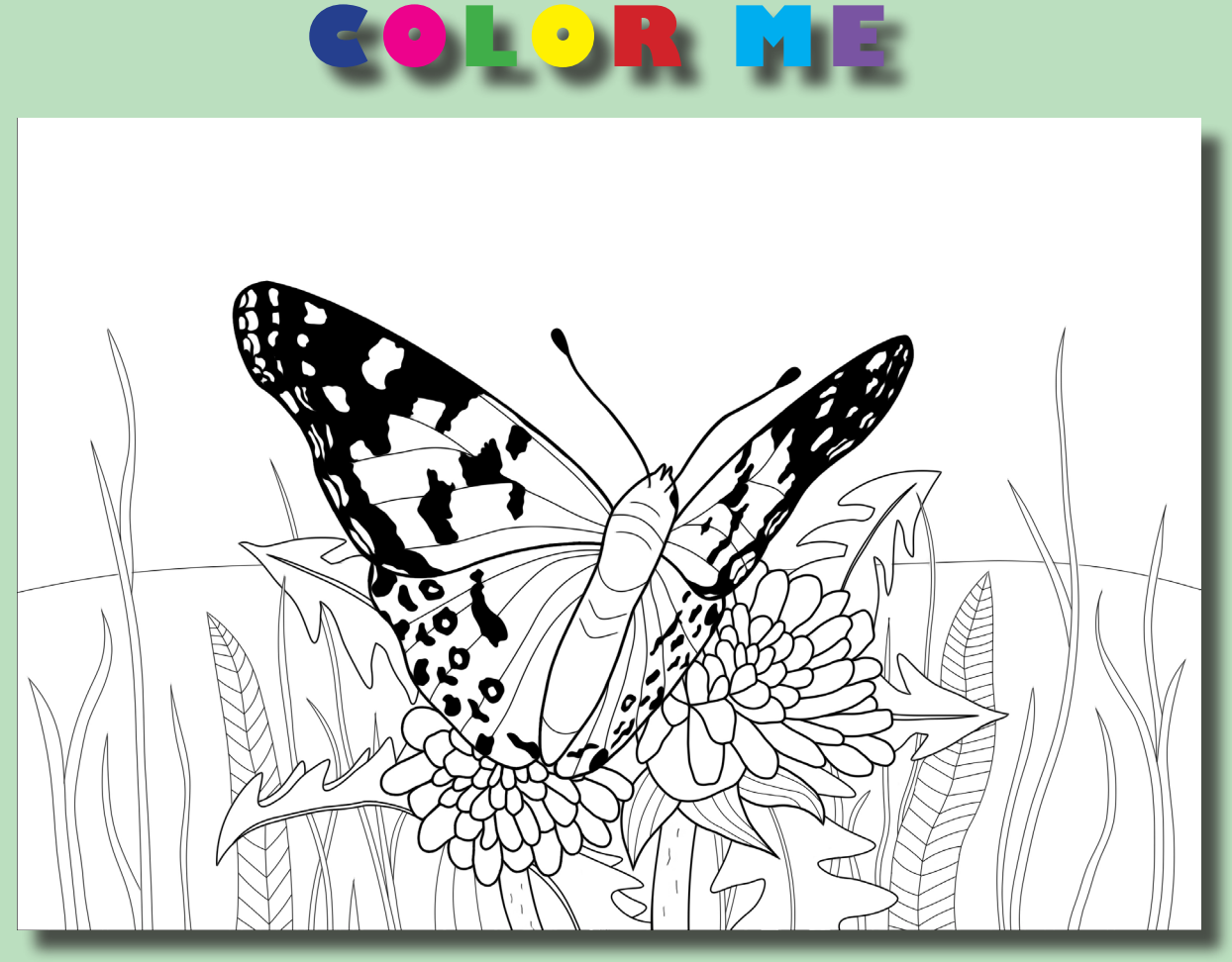
Idaho Department of Parks and Recreation parksandrecreation.idaho.gov