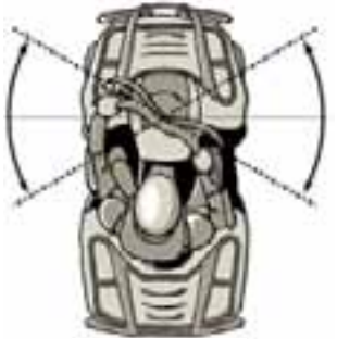
Figure 3 Handlebar Control

The operator must also be able to turn the handle bars from lock to lock while maintaining throttle and brake control.